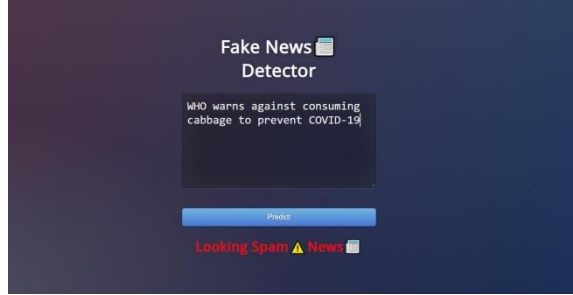
Fig 2. The interface showing the predicted news as fake.