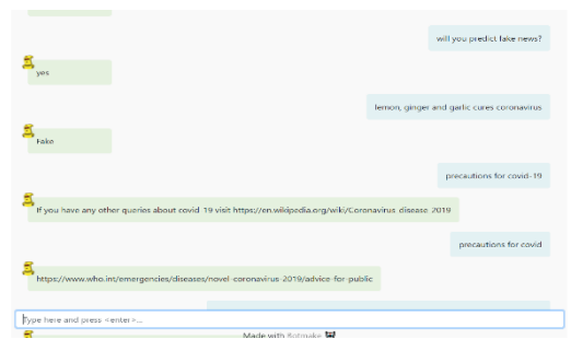
Fig 4(b)Interacting with Chatbot